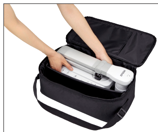
Carrying case included.